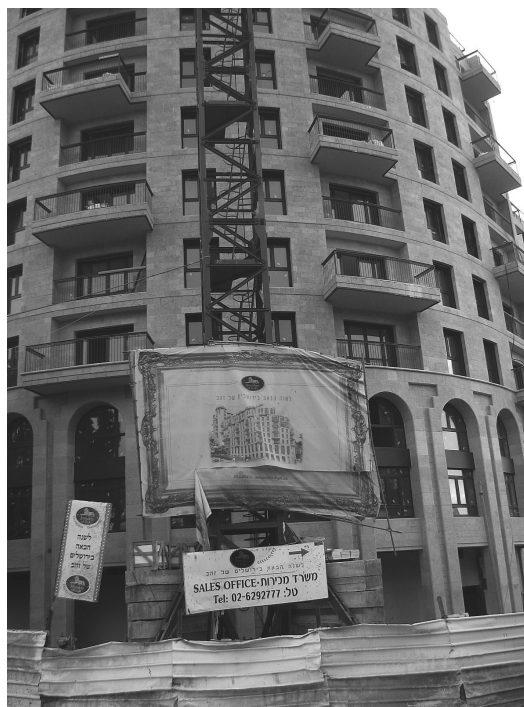
Figure 3: “Jerusalem of Gold” Housing Compound

The most significant message to potential buyers is no doubt the religious and national centrality of Jerusalem. Thus several large images of “historical Jerusalem” are presented. The first instance is an image of archaeological