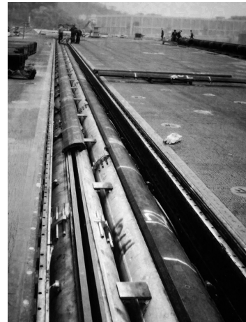
Figure 8: Steam Catapults of the USS Independence (Koichi Sato)

In addition, the PLA Navy has no experience in the operation of aircraft carriers. The take-off and landing of the carrier's aircraft is a very difficult and dangerous job because the operation is always influenced by strong winds at sea. Even the skillful U.S. Navy has lost some pilots in the past. 73 As I mentioned above, the capability of the PLA Navy to orchestrate many warships is not that of a full-fledged blue water navy. The PLA Navy is at their beginning stage as a blue water navy. It will take a long time for them to operate a standard aircraft carrier battle group which can orchestrate warships, aircraft and submarines for oceanic surface, air, and underwater defense of the aircraft