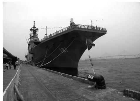
Figure 7: JMSDF’s Helicopter - escort ship, Hyuga (Koichi Sato)

China imported foreign aircraft carriers for research purposes, namely the Melbourne (displacement 14,224 tons) from Australia in 1985, the Minsk (displacement 42,000 tons) and the Kiev (displacement 42,000 tons) from Russia in 2000, and