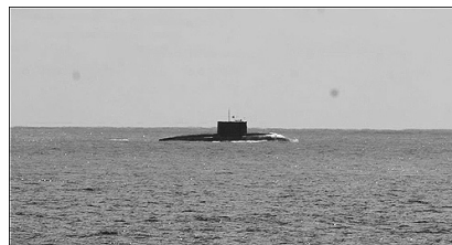
Figure 6: PLA Navy's Kilo Class Diesel Submarine

Further, the PLA has always dispatched the same tanker, the second Fuchi class tanker Weishanhu (displacement 21,750 tons). The Weishanhu accompanied the PLA Navy fleet on the