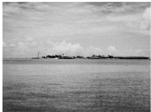
Figure 3: Artificial Island of Swallow Reef (Koich Sato)

It can be said that ASEAN's conference diplomacy had been successful until the Declaration of the Conduct of Parties in the South China Sea in 2002, but the Chinese government's attitude changed. They preferred bilateral negotiations and have tried to avoid conference diplomacy. The Chinese Ambassador to ASEAN said that "ASEAN never utilized its own conflict solution mechanism, the High Council in Treaty of Amity and Cooperation in Southeast Asia (TAC), for internal ASEAN disputes, and has always negotiated issues bilaterally. Given this, we should adopt bilateral negotiations for the Spratly issues, too. It is unfair that ASEAN leaders insist on multilateral