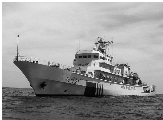
Figure 4: A Patrol Vessel of the Chinese Ministry of Transport (Japan Coast Guard)

Regarding the Chinese maritime security agencies, at least five agencies (the State Oceanic