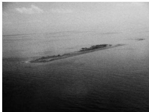
Figure 1: Artificial Island of Swallow Reef (Koichi Sato)

Before World War II, the ROC, the French Colony of Indochina, and Japan competed for sovereignty over the Spratly Islands, and the Imperial Japanese government incorporated the Spratly Islands into Japan's territory as a part of Taiwan, and called them the Shinnan Islands in 1938. 10 Japan was forced to renounce all its foreign territories after World War II. The ROC declared that all the islands were a part of Chinese territory in 1947, and stationed troops in Itu Aba Island. 11