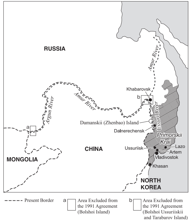
Figure 1: Sino-Russian Eastern Border

The timing of these surveys makes it possible to deploy as close an approximation of an experimental before-and-after test of migration attitudes as any previous study was able to achieve with mass opinion data. The data offers a methodologically rigorous test of the social and political effects of the border demarcation process on public responses to Chinese migration in the region. The first (2000) survey took place during intense public debates in Primorskii Krai on Russia-China border demarcation talks and, in particular, on the ability of Russia's federal government to implement agreements with China so as to preclude any escalation of China's territorial claims that the local residents feared would result in a loss of local territories. The second (2005) survey took place several years after the 2001-elected governor of Primorskii Krai stopped protesting border demarcation as Moscow's betrayal of Russia's national interest and more than six months after Russia's national legislature, the State Duma, ratified the final border demarcation and settlement agreement for the eastern section of the Russia-China border in May 2005. In the same time period, economic and regional development issues became more salient than migration and security implications. 8 Also, the survey samples were designed to tease out spatial differences in these effects