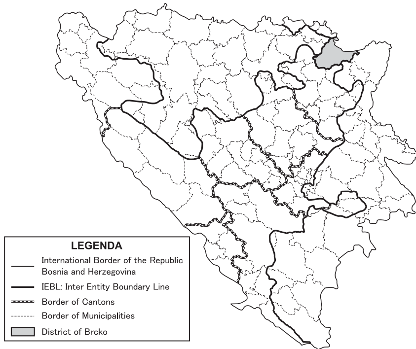
Figure 3 Bosnia and Herzegovina: The Inter Entity Boundary Line (IEBL)