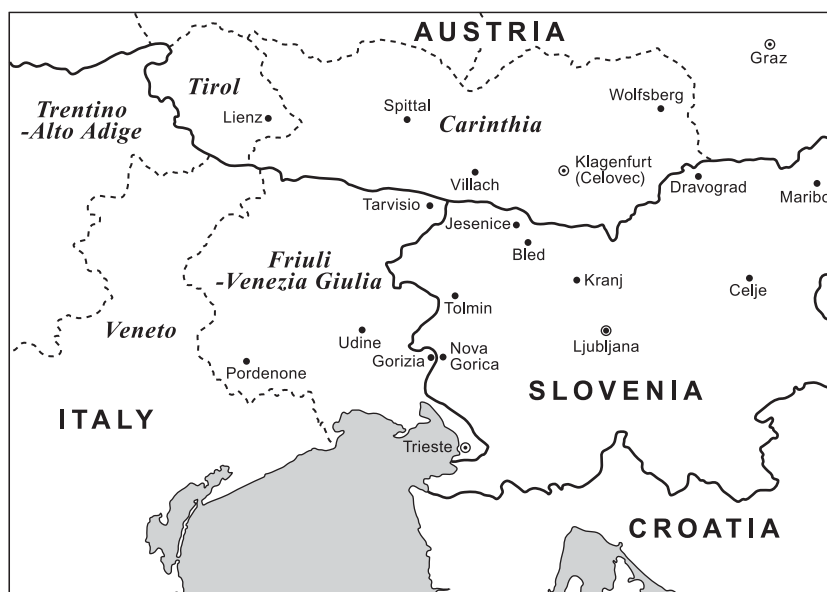
Figure 4 The Three-Border Area of Italy, Austria and Slovenia: Geography

negatively affected by the IEBL, because improvement of roads, train schedules and maintenance has to be negotiated and planned well in advance.