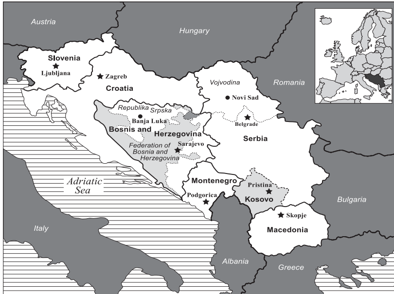
Figure 1 Nation-States on the Territory of Former Yugoslavia, 2008