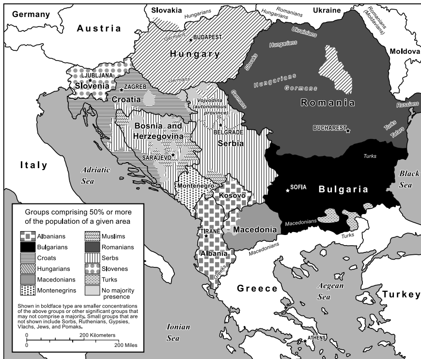
Figure 2 The Ethnic Puzzle in the Balkans

member candidates of the Western Balkans: Serbia, Macedonia and Montenegro. Croatia had this status since 2004. In 2010 the visa requirements were additionally lifted for residents of Bosnia and Herzegovina and Albania. 5 The only remaining nation-state not enjoying this EU-privilege is the Republic of Kosovo. In addition to threats of further disintegration of existing nation-states, in particular within Bosnia and Herzegovina (the case of the autonomy of the Republika Srpska), bilateral disputes remain the biggest obstacle for a peaceful regional co-operation after the violent disintegration of Yugoslavia 20 years ago. Among bilateral disputes, disagreements on nation-state border delineation are most serious.