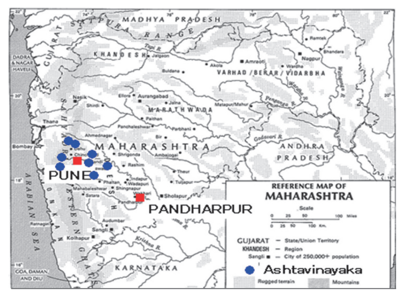
Figure 1. Taken from The Experience of Hinduism , ed. by E. Zelliot and M. Berntsen.

There are two well-known pilgrimages in the state of Maharashtra, western India. One is the Pandharpur, held at fixed times, and the other is the Aṣtavināyaka (eight Gaṇeśa). The former is comparatively arduous and regimented, while the latter is more personal and pleasure oriented. Maharashtra has eight temples sacred to Gaṇeśa (collectively known as the astavinayaka ), all located within a hundred-kilometre radius of the city of Pune. The aṣtavināyaka is a popular pilgrimage comprising a visit to all eight of these Gaṇeśa temples. Attracting many pilgrims, both pilgrimages contribute to the regional identity of Maharashtra. This paper shows that these two Hindu pilgrimages in Maharashtra are useful examples to help better understand the role of pilgrimage in modern India.