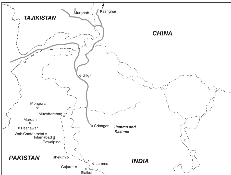
Fig.1 Gilgit Route: Map 1

Therefore, the trajectory of developments suggests that India, Pakistan, Afghanistan and Kashmir are closely interwoven in a network relationship, which has to be based on peace-keeping their own security, keeping in mind their shared past and mutual economic interests. However, it entails that all contending players keep their options open for dialogue based on a zero-sum principle. By doing so, they would develop confidence to resolve border disputes, which, in turn, would culminate in geographical reunification and restoration of trans-Kashmir ancient trade routes, the offshoots of the “Grand Silk Route” connecting China and Rome across the Middle East, South and Central Asia. One major route crisscrossing Kashmir across the Karakoram in the east connected India with Central Asia (modern Kyrgyzstan) through Srinagar and Ladakh in Jammu and Kashmir (India) and the Chinese part of Central Asia called the Xinjiang Uighur Autonomous Republic. The second route passed through Srinagar and Bandipora in Jammu and Kashmir (India) and reached Gilgit in AJK (Pakistan), where it took three different directions, one again crossed the Karakoram, then moved up towards Xinjiang in the east, another route traversed the Pamirs in the north, entered Murghab and reached modern Tajikistan (Gilgit Route: Map 1), and yet another route crossed over