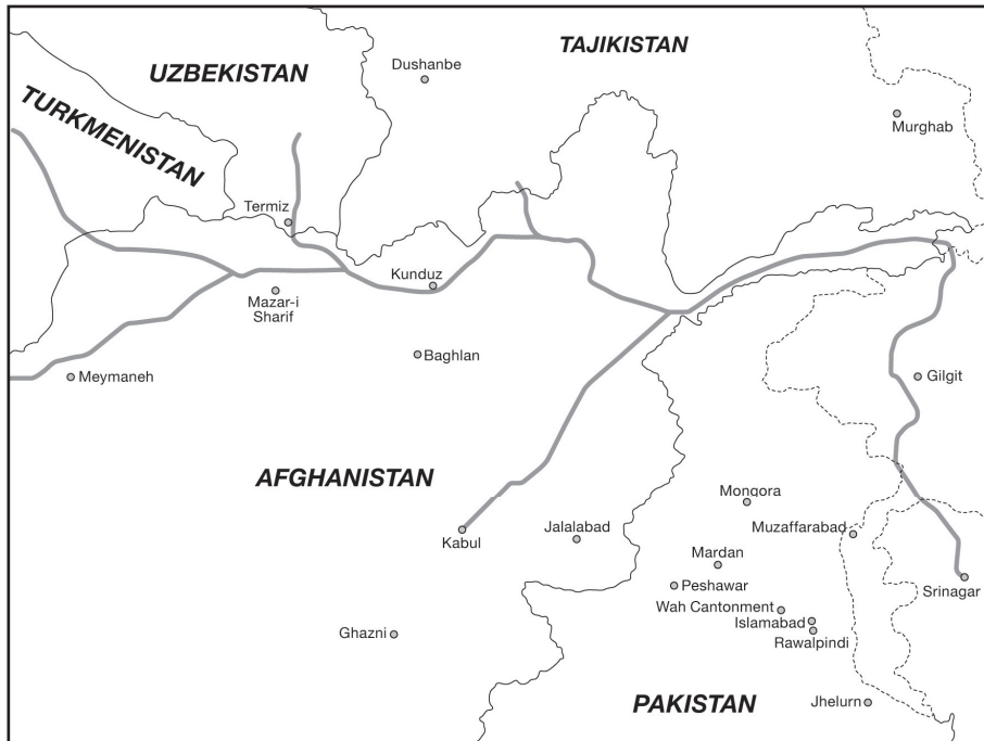
Fig.2 Wakhan Route : Map 2

the Pamirs to enter Wakhan Corridor in the northwest and terminates in Afghanistan-controlled Badakhshan. On reaching there, it split into two sub-routes, one down west towards Kabul, and another southwest towards the modern Central Asian states of Tajikistan, Uzbekistan and Turkmenistan and Iran along the Afghan cross border-points at Kunduz, Termiz, Mazar-i Sharif, Jalalabad, Sheberghan and Meshad respectively (Wakhan Route: Map 2). The fourth principal route originating from Srinagar in Jammu and Kashmir (India), traversed Muzaffarabad and Rawalpindi in AJK (Pakistan), moved ahead towards Peshawar or Gandhara (Pakistan), crossed over the Hindukush and Khyber Mountains, reached Kabul in Afghanistan, and then moved to the Central Asian states and Iran along the aforementioned Afghan cross border-points. (Srinagar-Muzaffarabad or Gandhara Route: Map 3). All these routes were interconnected within the same geographical space by several other micro outlets including Kargil-Iskardoo, Poonch-Rawalakot, etc. To reiterate, these transmission channels were very useful in promoting inter-faith and intercultural dialogue, providing employment to millions of people, and facilitating the sharing of knowledge, expertise and ideas among different social groups.