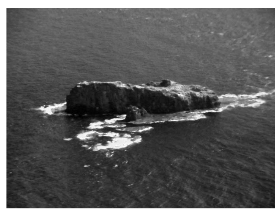
Figure 3 The Senkaku Islands/Taishojima Island [Koichi Sato]

in the Chinese maritime defense area from the Ming Dynasty era, and they belong to Taiwan, not to Japan's Ryukyu (Okinawa) Islands. Japan deprived China of these islands during the Japan-Qing Dynasty War, and forced the Qing Dynasty government to cede Taiwan and these islands at the "unfair" Treaty of Shimonoseki in April 1895. After World War II, the Japanese government illegally ceded Senkaku Islands to the United States, and the U. S. government declared that they have the