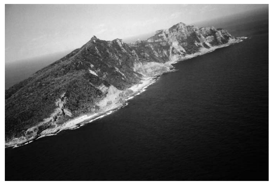
Figure 2 The Senkaku Islands/Uotsurijima Island [Koichi Sato]