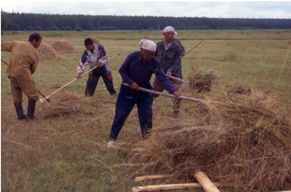
Photo 2. Hay-making activity in Chiuiia Alaa [near Chiuiia village in Megin-Khangalas District, 25 July 1999]

The agricultural production space surrounding the village, the grasslands, and the forest is identified as locally shared common ground for the local population regardless of the implications of judicial concepts. The Sakha people in this case allow people to have exclusive rights for making hay for their livestock. Importantly, these rights delimit the resources for hay making and are seasonal by nature: exclusivity begins from spring when the grass begins to grow—the pre-harvest condition—and lasts until the end of hay making. The grassland post-harvest is opened so that any local people can conduct