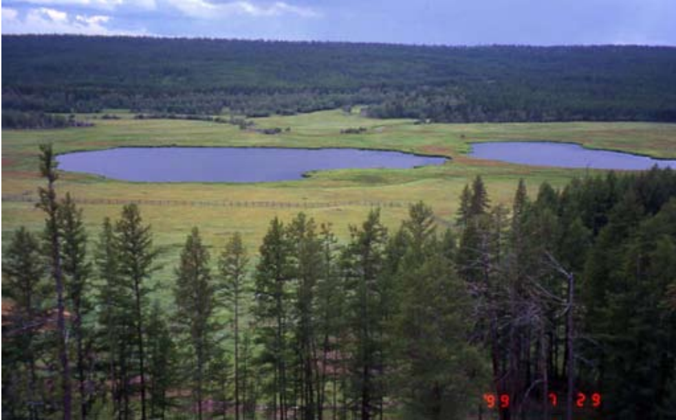
Photo 1. Typical landscape of the alaas [near the Abaga village in Amga District, 29 July 1999]

(photo 1). Alaas topography starts to form when the surface ground increases in temperature due to, for example, the decay of fallen trees, causing the surrounding permafrost to melt. 9 One of the Sakha's traditional proverbs narrates the importance of the alaas , with their lakes, for their livelihood: "We have lakes as there are stars in the sky; the lakes satisfy everyone." The grasslands and lakes bring affluence to the people. 10 The Sakha people depend on these alaas , other river terraces, and valleys 11 for their settlements and livelihood, which is mainly horse and cattle husbandry requiring the alaas grasslands for pasture.