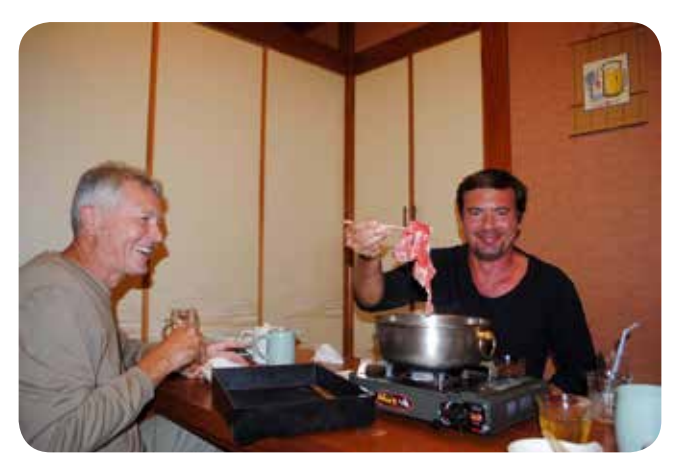
staying in Sapporo at the same time