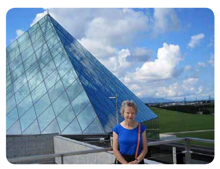
In Moerenuma Park in the Sapporo suburbs

understand why anyone would live elsewhere than in the best city... Set against this relentless urbanism, life in Sapporo and work on the Hokkaido campus offered the best medicine: country and city were blended. Corn grew in urban backyards! I planted and harvested tomatoes outside the foreign residents' apartments. The air smells deliciously of the fields, spring, summer, fall. The laundry can be hung up in the sunshine. The campus has its streams, fields, even cows! So here country and city, academy and farm were put together, lived