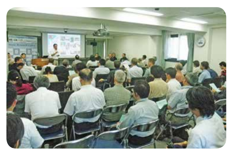
The session "New Perspectives on Eurasia's Arctic Borderlands," which was fully occupied

The symposium consisted of the following five sessions: "Introducing North American Borderlands," "New Perspectives on Eurasia's Arctic Borderlands," "Borders and Language: Case Studies from the Slavic World," "Trans-border Environmental Issues: Chernobyl, Fukushima, and the World," and "Border Studies: A Compass towards a New World