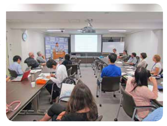
A scene from the program of the summer school "Borders in Eurasia"

The latter exhibition is a compilation of all exhibits and materials collected and created by members of the GCOE project in the last five years. The exhibition catalogue Illustrated Borders in Eurasia and Japan (Hokkaido University Press,