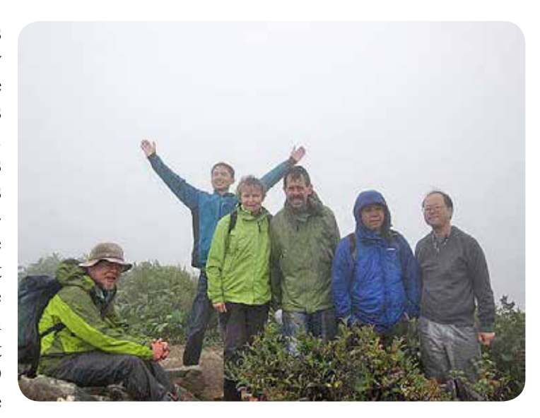
SRC gave me the time to construct At the top of Mount Fuppushi (with her spouse, etc.)

As for the classifications that obfuscate rather than clarify research and writing, my favorite candidates for questioning this summer were "bureaucracy" vs. "personal" ways of rule. I was working on a study of Russia's "land captains" (zemskie nachal'niki)—officials who were supposed to oversee peasant affairs in most provinces of the empire. While doing research in Kazan earlier, I had found a set of inspections conducted in 1909 of these officials. My stay at the a data base using these reviews