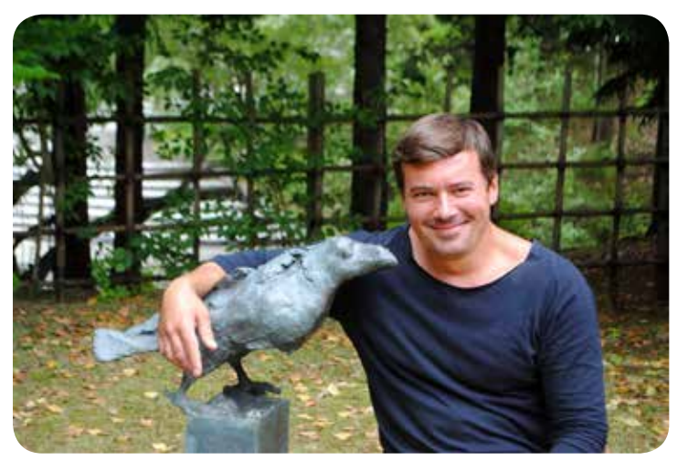
With a bronze statue of a crow in Sapporo Art Park

Прошло уже почти пять месяцев, как мы живем в Саппоро. Немного попутешествовав по Японии, мы, во-первых,