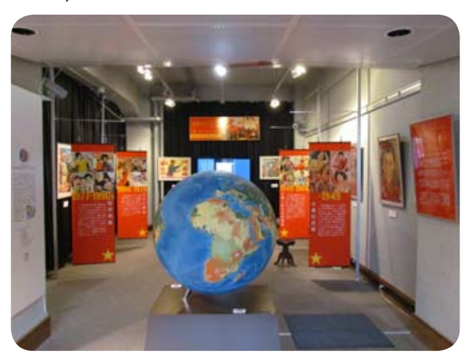
The sixth exhibition of the GCOE program: "China Seen from Across the Border"

This year, we held three exhibitions at Hokkaido University Museum: "The Indigenous People (Yaqui and Ainu) and the Border" (Nov. 2010 – May. 2011), "Languages Go Beyond the Borders: Russian and East European Writers' Work and World" (May. 2011 – Nov. 2011), and "Spillover Images: China in the Media" (Nov. 2011 – May 2012). Serial seminars were also held along with the exhibitions. The exhibitions and seminars were open to the public and attracted many citizens.