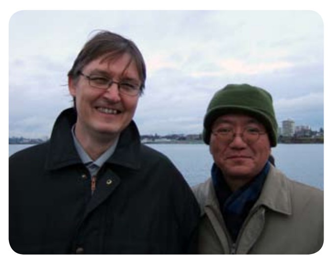
BRIT IX reunion on board to the States from Canada

Another goal that the Global COE Program "Reshaping Japan's Border Studies" set up is to bring international border studies in Eurasia and Eastern Asia together and "sell" them to the world. For that purpose, we invite a European-born research network, Border Regions in Transition (BRIT) to Japan. Having trouble with the Northern Territories issue, it is impossible to host an international border symposium with Russia. On that account, we plan to invite BRIT in Fukuoka and Busan crossing the Tsushima offshore, whose borders are the most stable (clearest) in the areas surrounding Japan. It is a