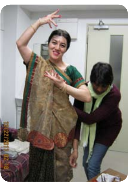
An Armenian researcher dancing in Indian costume