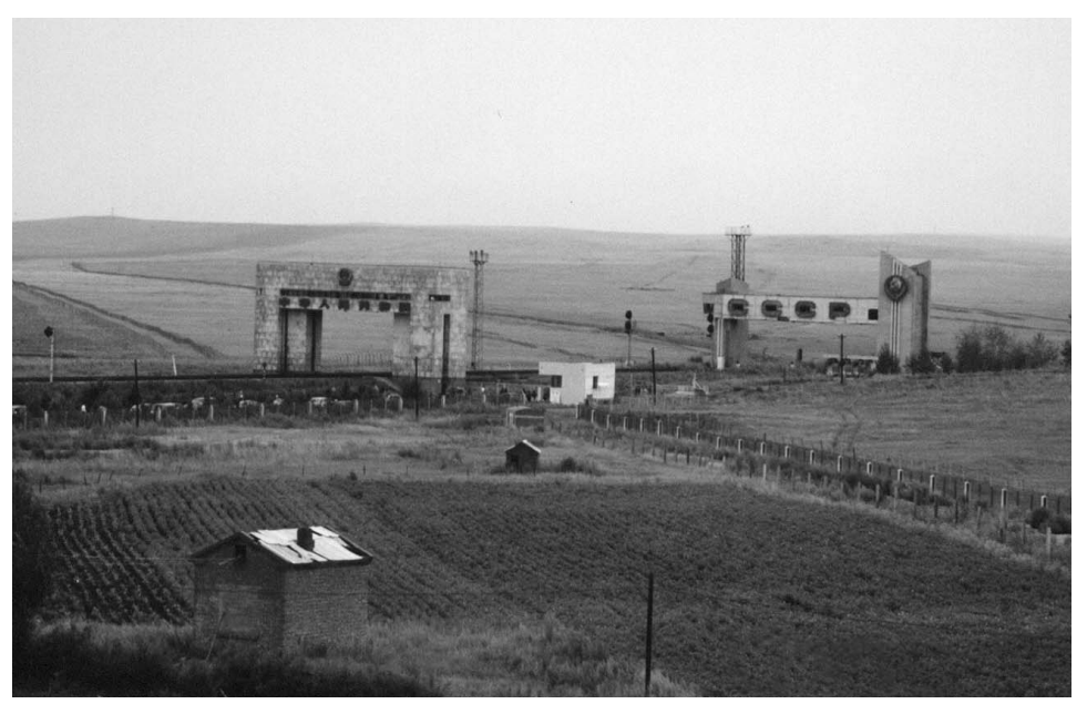
Sino-Russian railway gates on the border (Jul., 2000)

The station does not seem to be strategic, because Russia had itself controlled Manzhouli. The development of the village began as a train junction after the Russian transfer of the Chinese Eastern Railway over to China in the 1950s, but was again halted because of the Sino-Russian conflict in the 1960s.