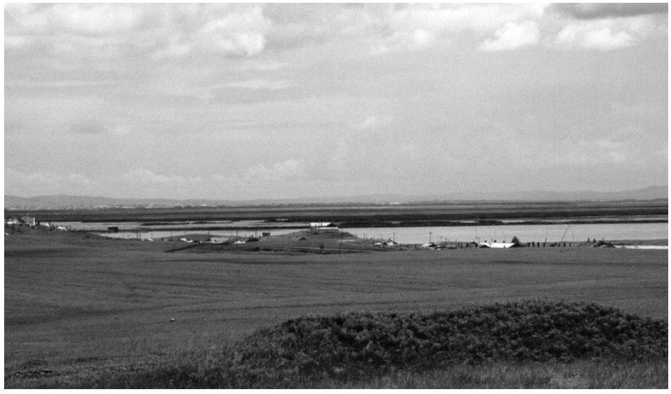
Abagaitui on the Argun River (Jul., 2000)

there. A milestone in memory of the Chinese resistance during the incidents can be seen on the road on the way to Abagaitui from Zhalainor (Xu Zhanjiang 1992: 31; 48-52). Under Japanese control in the 1930s, a route from Abagaitui to the Argun River became necessary for Chinese communists communicating with the Soviet Union (Xu Zhanxin 1999: 13-14; 49-50). Bol'shoi Island is only 50 square kilometers, but the Russian Trans-Baikal Army resisted its transfer to China because of its strategic importance.