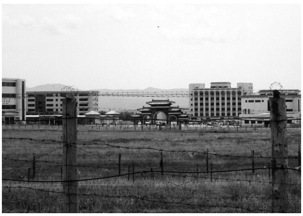
A scene on Sino-Russian "joint economic zone" (planned) from Zabaikal'sk (Jul., 2000)