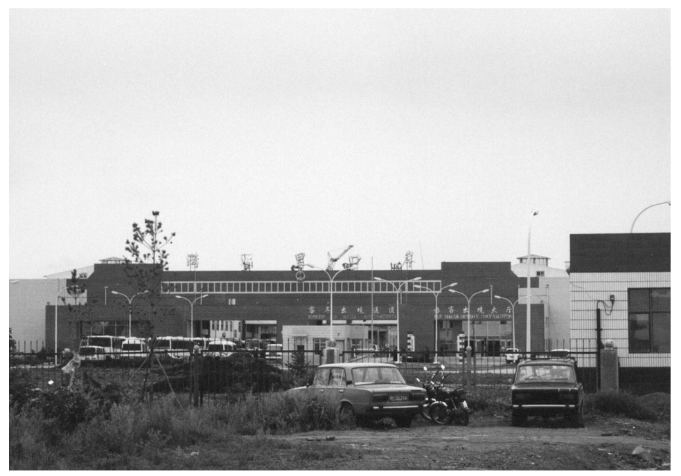
Manzhouli customs (Jul., 2000)