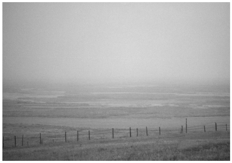
Menkeseli on the Argun River (Jul., 2000)