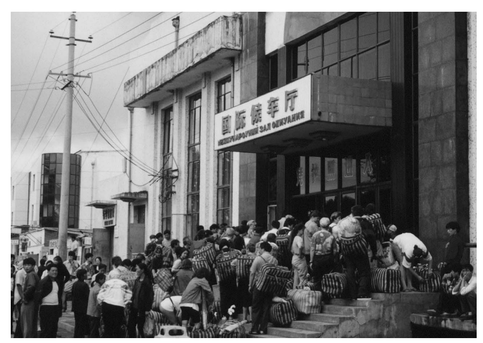
Russian shuttle traders at Suifenhe Station (Aug., 1995)

Just after that, Suifenhe was encouraged by the collapse of the Soviet Union and Deng's "Southern Speech" (Suifenhe bao Mar. 10, 1992).