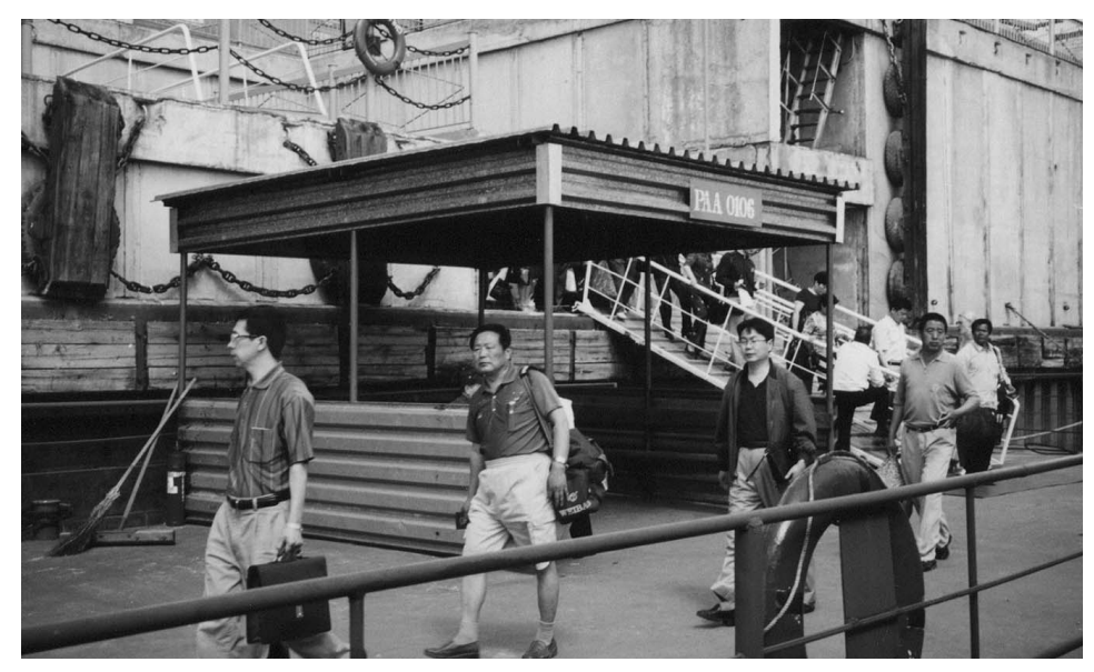
Chinese tourists at the port (Blagoveshchensk, Jun., 2002)

goods carrier, hired by Chinese merchants staying in Blagoveshchensk. "Bricks" arose after Russian authorities tightened their border passing procedures for Chinese. This is because Russians can easily go through Russian customs. The origin of the name is not clear, but it is said to come from the nylon package used for baggage shaped like a brick.