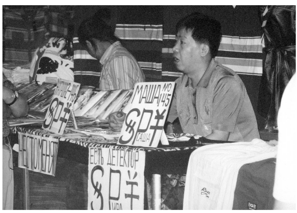
A Chinese money changer (Jun., 2002)