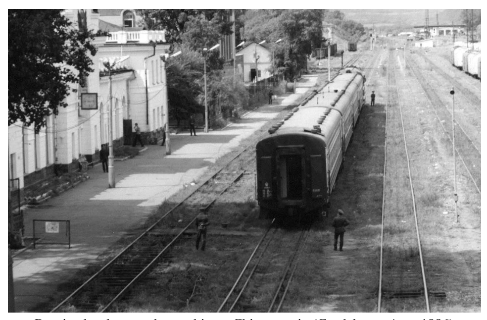
Russian border guards watching a Chinese train (Grodekovo, Aug., 1996)

The Japanese government soon recognized the importance of Suifenhe, which offered a chance to advance into China from the Korean Peninsula and opened a Consulate there in 1927. The 1920s were a glorious period for the now "internationalized" city, Suifenhe. But after the Chinese Eastern Railway incidents in 1929, the situation changed. The railway was damaged by the Russian army (it was repaired in January 1930) and then the city itself was attacked by two thousand Japanese soldiers and at last occupied on January 5, 1933. Suifenhe, together with its railway, remained under Japanese control until August 9, 1945 (Suifenhe shizhi: 12-18). The railway was handed over to China in 1952, but skirmishes increased in the 1960s. In January 1968, when a Chinese citizen entered into Grodekovo from Suifenhe, he was beaten by a Russian militant for