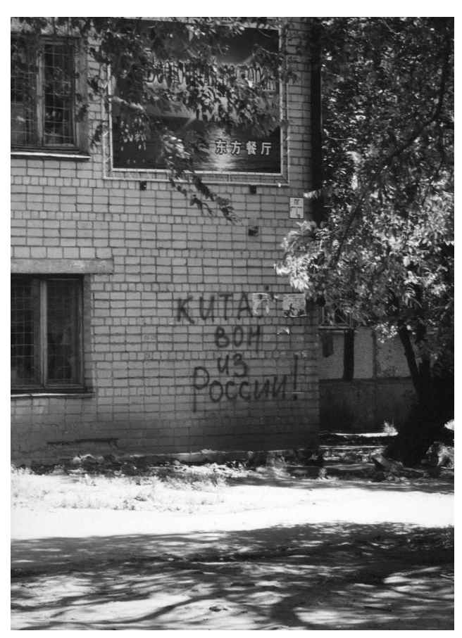
Graffiti reading "Chinese, get out of Russia" on the wall of the Far East Hotel (Blagoveshchensk, Jun., 2002)

the long governor's political life in Khabarovsk and Primor'e. Amur's general political preference is toward Communism — Amur Oblast belongs to a so-called "red belt zone" — but a "pro-reformist" governor was once elected. However, no governor has tried to damage its ties with China or the Chinese. A local newspaper, "Amurskaia Pravda," occasionally covers the troubles with Chinese or concerns with Chinese "migration," but seldom tries to flame up a "Chinese threat" or organize an "anti-Chinese campaign" as Vladivostok and Khabarovsk sometimes do.