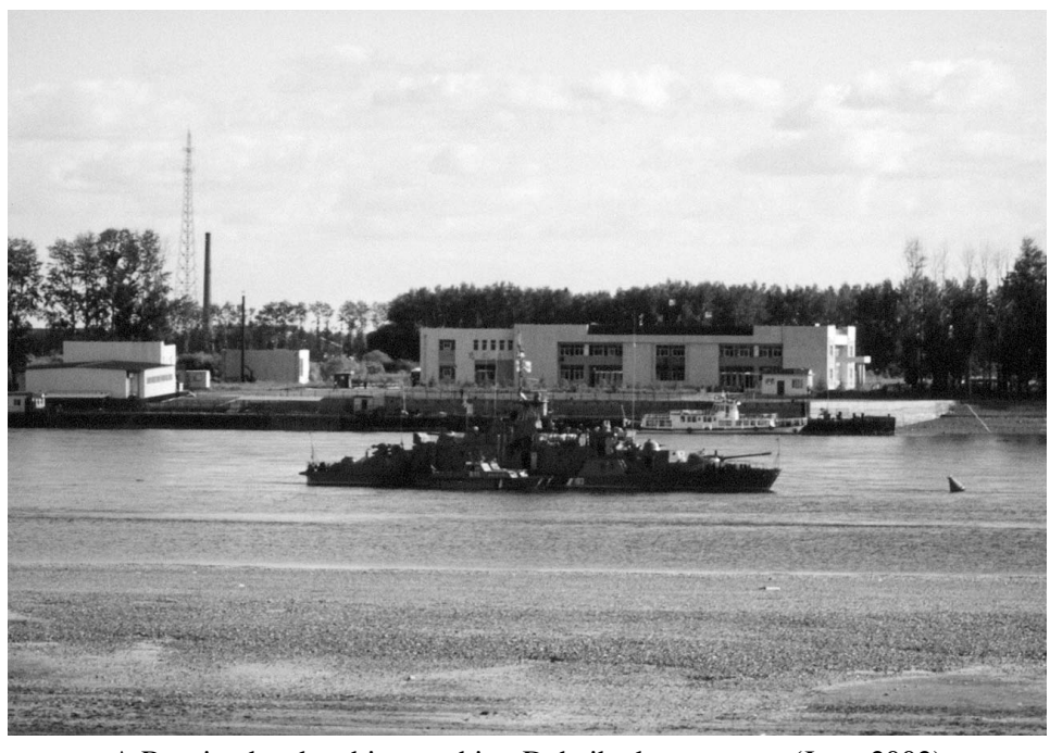
A Russian border ship watching Daheihedao customs (Jun., 2002)