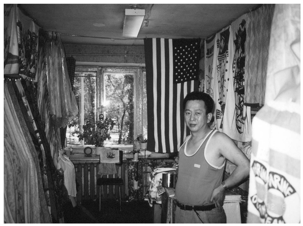
A Chinese merchant with a Russian multiple visa at the Far East Hotel (Blagoveshchensk, Jun., 2002)

Some analysts have called the city the Chinese "Las Vegas." Considering the existence of a kind of Chinese "resident" with a multiple visa, or with a Russian spouse, Blagoveshchensk seems to be on its way to becoming a Chinese "colony."