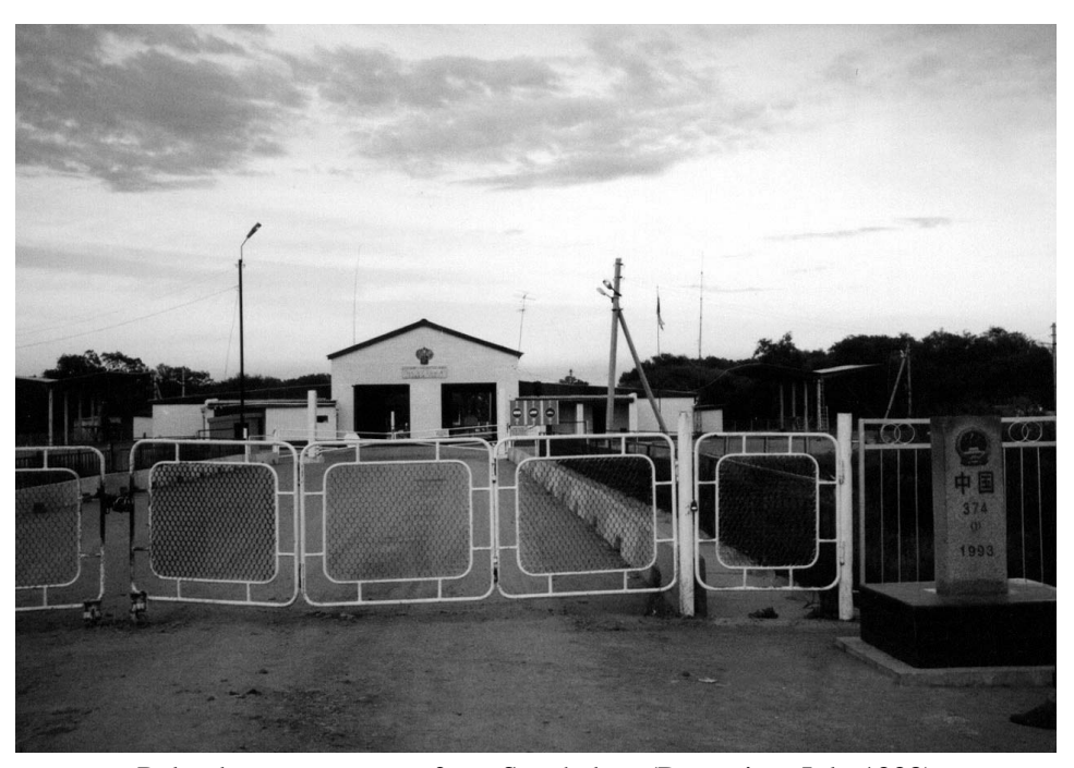
Poltavka customs seen from Sanchakou (Dongning, Jul., 1998)

In contrast, Suifenhe's dash for development appears to proceed as planned. If so, Dongning should not dream to repeat Suifenhe's success story, nor should it be deprived of a piece of the "transportation pie" from Suifenhe. Dongning might as well seek a way to supplement Suifenhe's functions, combining its border function with Suifenhe's for the common benefit of concentrating all cargo and passengers towards Russia, and elaborate a plan to be a "second Suifenhe" — this does not mean a rival of Suifenhe but a comple-