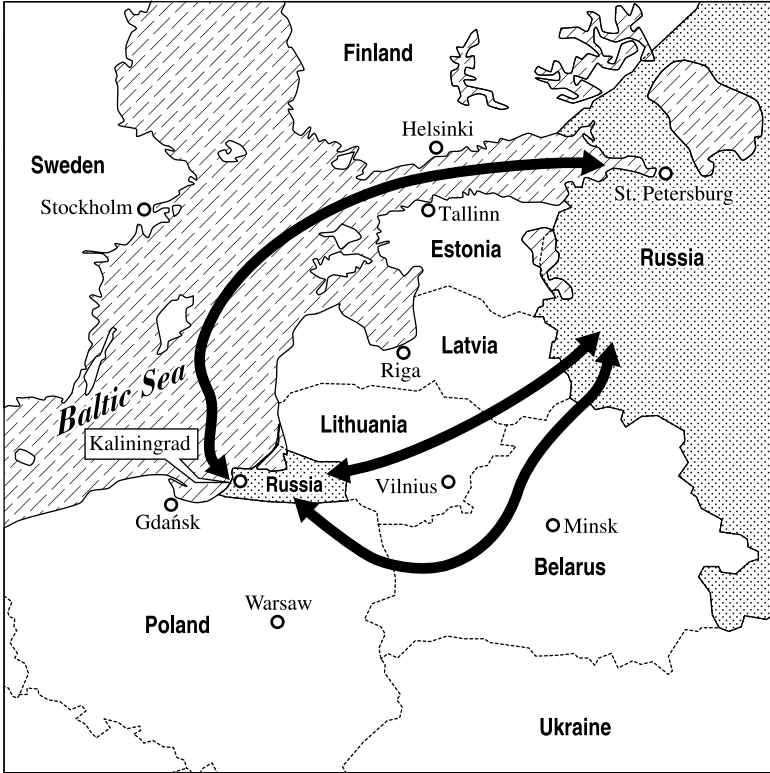
Access to Kaliningrad

of trilateral accession talks have been substituted for a more creative and businesslike approach. Its core is, instead of a formal involvement in trilateral negotiation formats, the implementation of trilateral EU-CE-Russia economic projects. The idea is to avoid presenting the EU and Russia as two opposing poles, but rather as “complementary parts of the European economic unity.” 17 In the institutional domain, Russia also succeeded in establishing a well-structured relationship with a permanent body for managing relations with the EU that resembles somewhat the NATO-Russia Council.